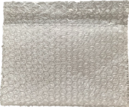
Bubble Bag 5" x 6.5" 1 unit