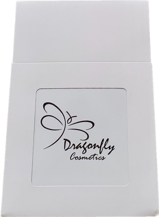
Mailer Box 6" x 6" x 3" 1 unit