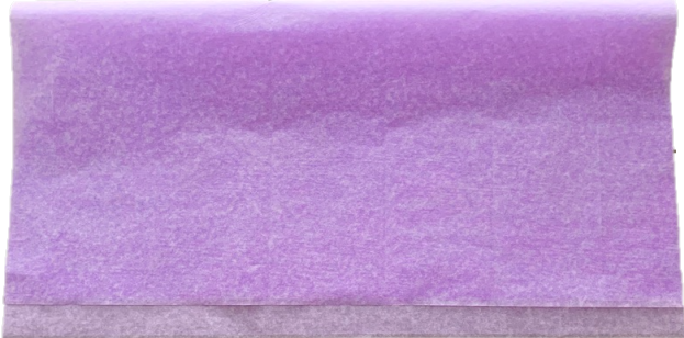
Lavender Tissue Paper 1 unit